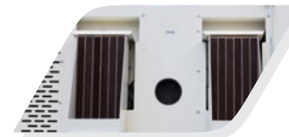
Pre-Suction & After-Suction