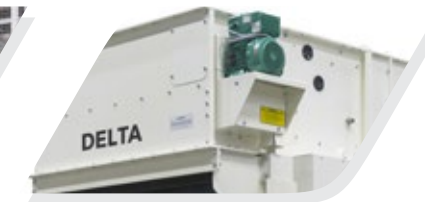
Inlet With Shaker Feeder