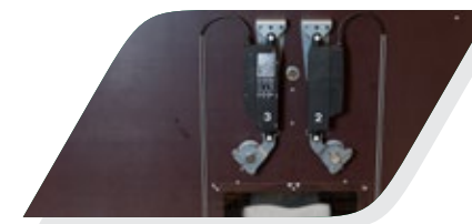
Electronic Control System