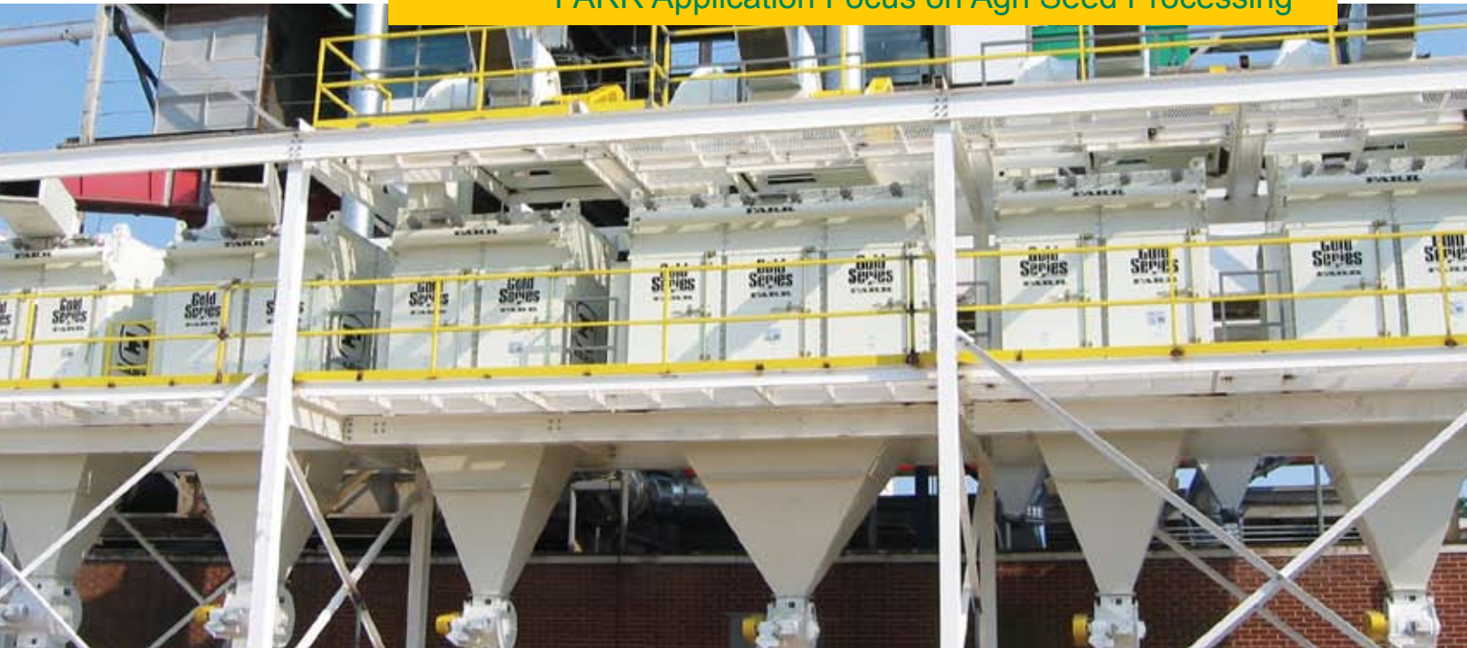
Multiple GS Dust Collectors on Corn Processing

With its cross flow inlet design and vertical pleated cartridges, the Gold Series® keeps material like bee's wings and corn silks from bridging. In extreme cases, nylon overbags can be installed on the cartridges to prevent bridging as well. With installations on every continent and various applications, we can customize a system to keep your seed plant clean.