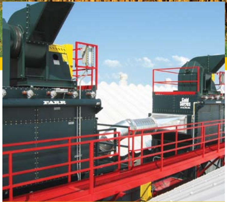
Two GS20's on Seed Cleaning

The Gold Series® dust collector can be used in a variety of Agricultural Seed Processing dust collection applications such as corn shellers, seed cleaning, seed preparation, seed coating, seed hybrid development and general facility ventilation. The vertical cartridge design works better and Farr APC is one of the few companies that can handle seed processing well.